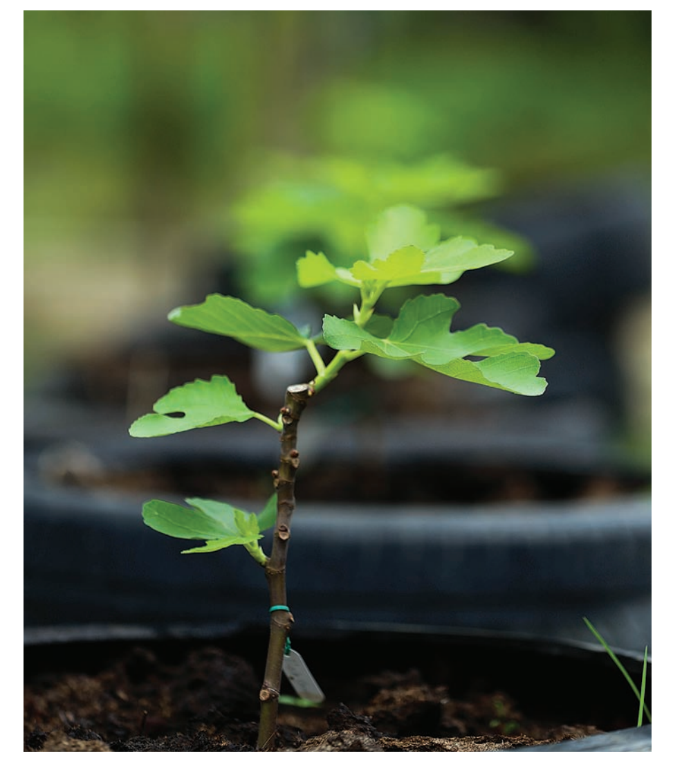
Given the focus and investment devoted to technological innovation in crop improvement, it is vital that maximal value is derived.

Given the goals and steps in the plant breeding process, innovation provides the means to achieve greater gains, increase efficiency, and accelerate time-to-market for improved